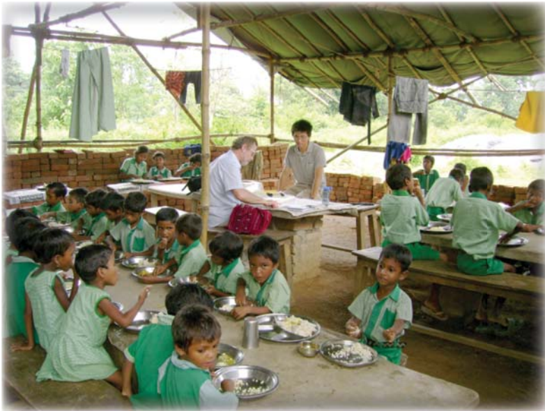
Dinning area with plastic sheet roofing.

In site development planning, EMI teams need to help Christian ministries trust in God's provision AND develop a realistic plan which is fundable - taking small practical steps by faith. These steps will enable the ministries to move towards the big vision that God has given them, to touch the lives of the poor and to transform communities.