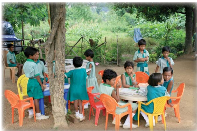
Children studying under the trees.