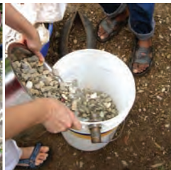
Gravel makes the bottom layer