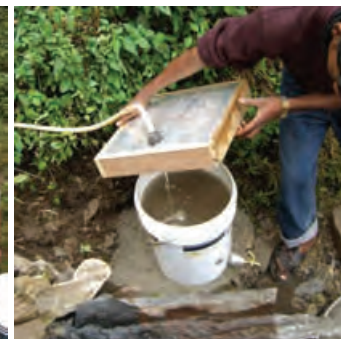
Filling the filter with water