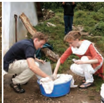
Sand sieved for impurities