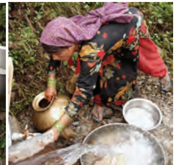
Villager collecting clean water