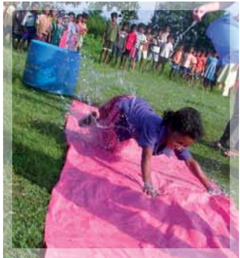
SIS kids enjoying a field day of games put on by the team.