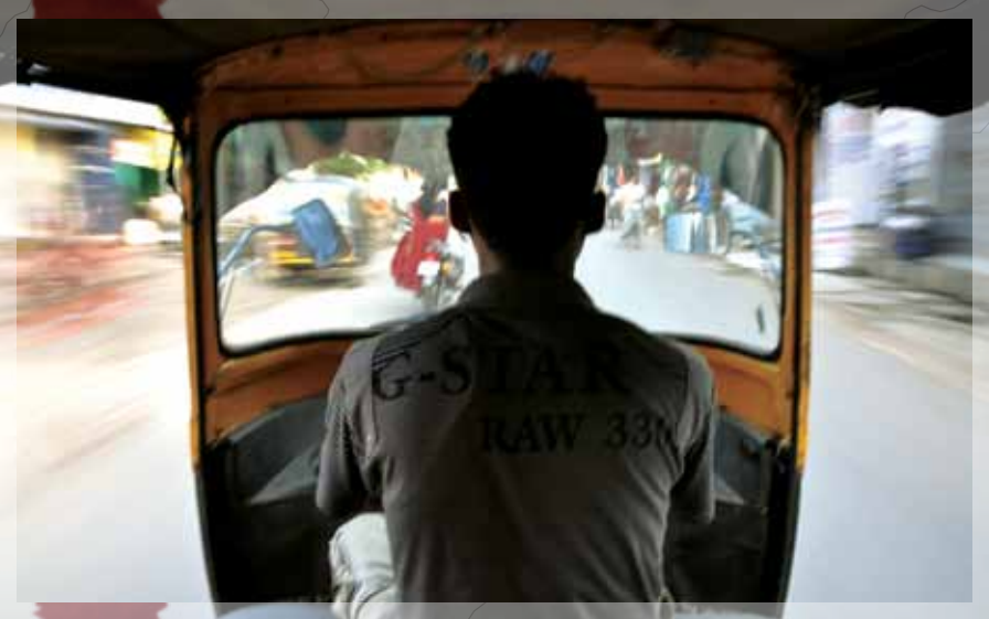
An auto rickshaw drive from the rail station

S ome situations eMi 2 staff, interns, and volunteers face are challenging. Sometimes events are funny, bewildering, scary, or sad. Our trip to Orissa included visiting the Shepherd's International School (SIS) school and seeing 65 children in colorful uniforms saying hello en masse when they saw us in the morning. At the school students from ages 4 to 14 learn gardening, fishing, pottery, milk production, crafts, entrepreneurship, and stewardship. These trade skills are taught in addition to the Bible, and along side standard subjects such as writing, reading, mathematics, and geography. The SIS