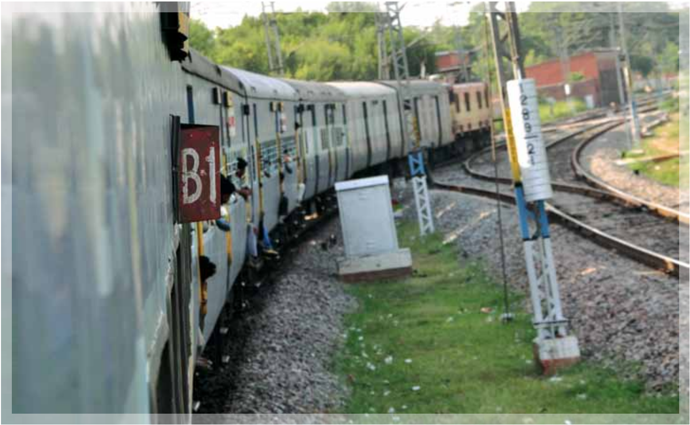
My favorite way to pass time on the train is to stand in the doorway and watch the Indian countryside pass you by, the sights are never boring. This photo was taken as the train was slowing and turning into a station. - Andy Kizzee