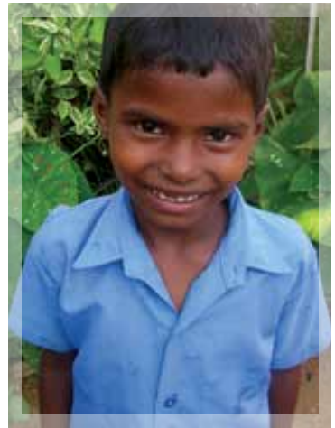
An SIS student