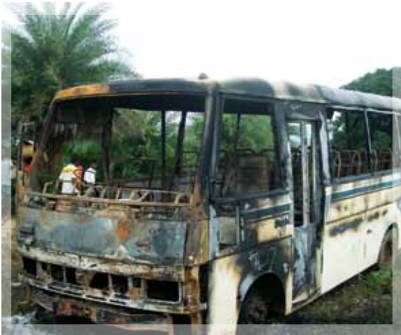
A reminder of the violence in Orissa

C urrently, SIS is teaching their children in two classrooms when it is raining. On sunny, dry days the children learn outside sitting at portable, round tables and chairs. What was unsettling to me was seeing the slouching backs and shoulders of many of the children as they walked and sat. It was as if they carried a large weight on their thin shoulders. The staff shared later that a number of the students are survivors of attacks on Christian families in 2008. The brutality those children